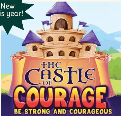
DAY CAMP-CASTLE OF COURAGE: Be Strong and Courageous